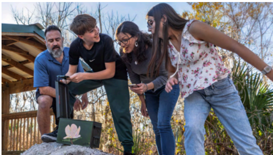
Register at Geocaching.com with GT4DE

Explore Bayou Sale Road , a haunted Louisiana byway rich in history, where the legend of a ghostly hitchhiker adds thrills to its stunning marshland scenery.