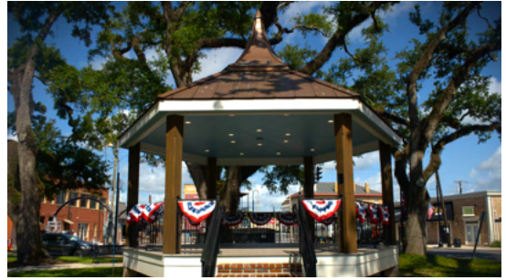
7850-7864 W Main St. | Houma, LA 70360

Isle de Jean Charles is a historic tribal homeland in southern Terrebonne Parish, now disappearing due to erosion and rising seas, with some residents staying to maintain their deep connection to the land.