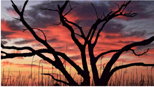
"Bayou Sale Rd, Chauvin, LA"

Explore Bayou Sale Road , a haunted Louisiana byway rich in history, where the legend of a ghostly hitchhiker adds thrills to its stunning marshland scenery.