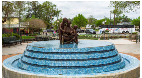
7925 W Main St. | Houma, LA 70360

Experience Downtown Houma , from coffee and beignets at Downtown Jeaux's to colorful murals, the iconic bandstand, and streets featured in Where the Crawdads Sing .